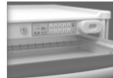
Dual Access lock