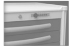
Push button lock