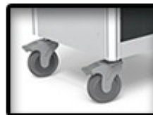
5" Caster (1 locking)