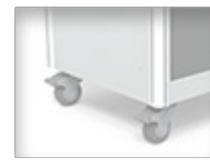
3" Caster (1 locking)